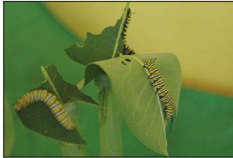
A few of our caterpillars munching on milkweed