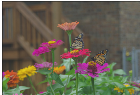
Newly emerged butterflies feeding on giant zinnias