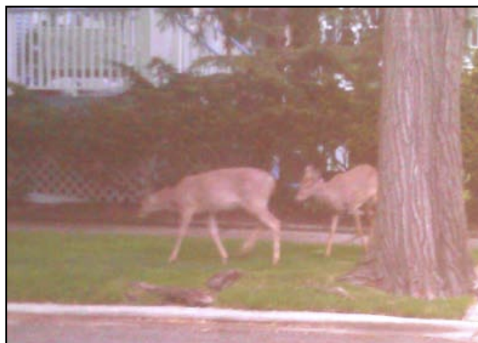
Suspected residents of the future Nature Preserve seen wandering on Summerdale.