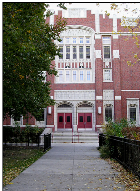
Amundsen once housed Truman College before becoming a high school.

Amundsen High School sits proudly on the corner of Foster and Damen avenues, sharing Winnemac Park with area residents and featuring