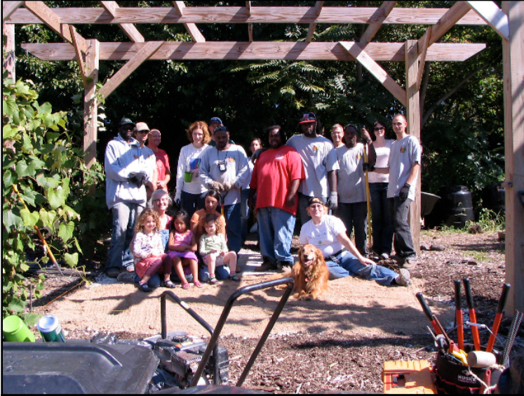
"Men anpil, chay pa lou," is a Haitian phrase which translates as, "Many hands make light the load."

In early fall, a crew from GreenCorps joined members of the BCO Garden Committee during one of four installation days in the Gateway Garden. The extra hands and the work they've done are all part of a $3,000 grant received from GreenCorps for the improvement of Gateway Garden. All efforts are greatly appreciated.