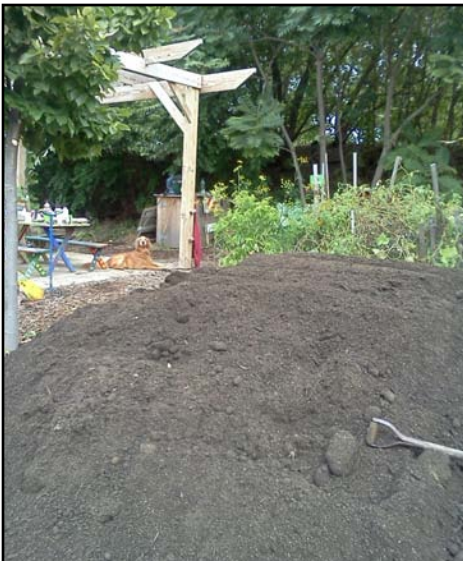
A pile of fresh soil was delivered and will be distributed amongst the beds.