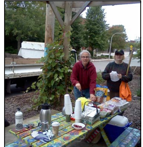
No garden outing is successful if not punctuated by a well-deserved lunch. Good food, fresh air and your hands in the dirt! What more could a volunteer ask for?