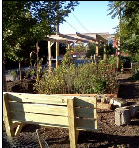
GreenCorps also helped the Bowmanville gardeners construct two wooden benches. From those perches, one can observe the evolving gardens and find a brief respite from urban life.