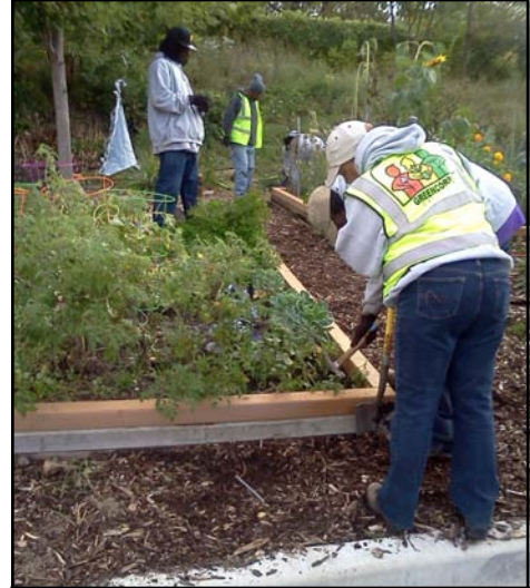
The GreenCorps and a grant for $3,000 allowed the Gateway gardeners to raise each of their beds to accommodate fresh fill.