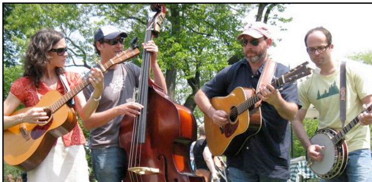
Hayward Bluegrass will be among the entertainers on the Fall Festival stage Saturday, October 15 from 1-4 pm.

The upcoming Fall Festival promises to be packed with fun and entertainment, and, as hard as it is to imagine, it may surpass recent fests in the annals of Bowmanville events.