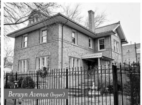
Berwyn Avenue (buyer)