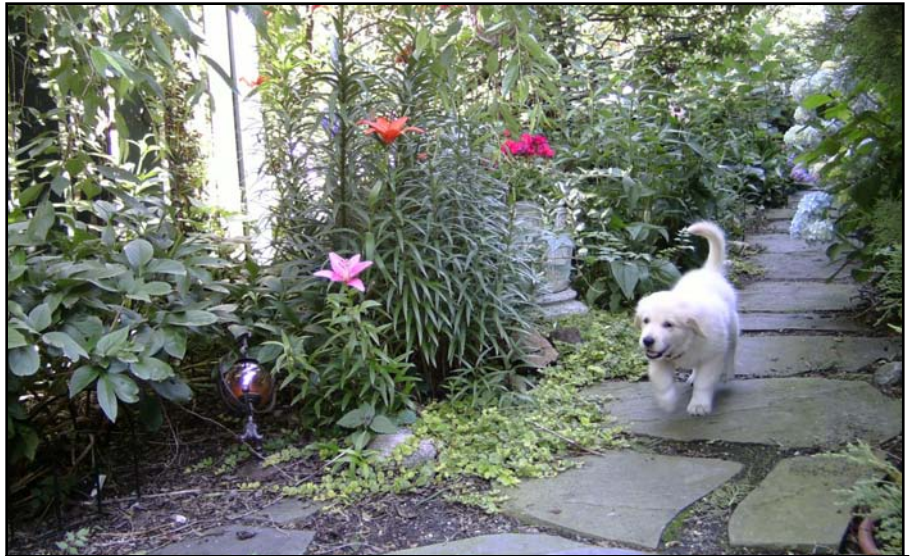
Visitors to the Garden Walk voted on 21 different photos submitted this year. There were a lot of great shots, but the winning photo, "Sweet Home Bowmanville," was taken by Sue Sell. Her winning photo will be used in the publicity for the Garden Walk next year.

The summer storms that continue to sweep through the area left flooded basements and considerable tree damage. If your car happened to be parked under one of those falling branches there was property damage as well, and for some, bodily injury (page 10).