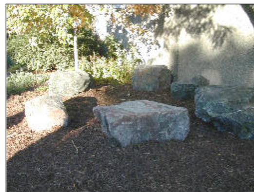
BCO Council Ring

organized BCO. They planted and nurtured the ideas and core values that have grown and evolved over the years. We have become a highly respected north side Chicago neighborhood civic organization of which you, as a Bowmanville resident, can be proud. We have one of the finest community gardens in the area, and it has been awarded first place in Mayor Daley's garden competition two times. Below is a picture of the most recent addition to the Bowmanville Community Garden - the council ring. It is made up of large stones where people can gather and sit for a while. This area is set aside for you to rest and talk with friends or just stop for a moment and enjoy the garden and local wildlife.