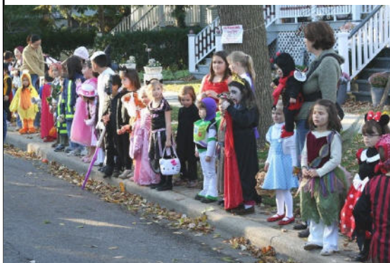
BCO Halloween - 2007